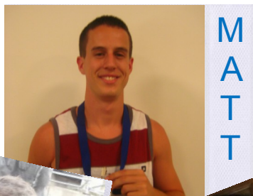
M A T T